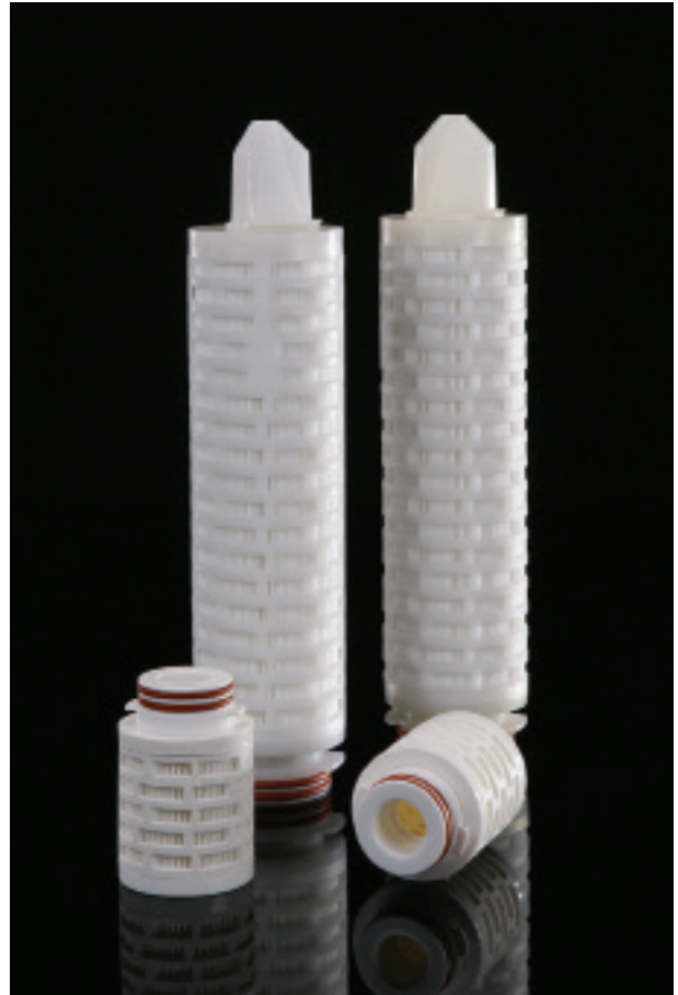
Note: TETPOR is a registered trademark of Parker Hannifin Corporation.